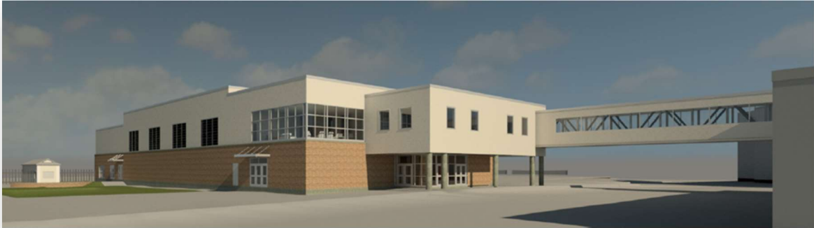
Phase 1 (New Gym Addition) Architectural Rendering Northwest View