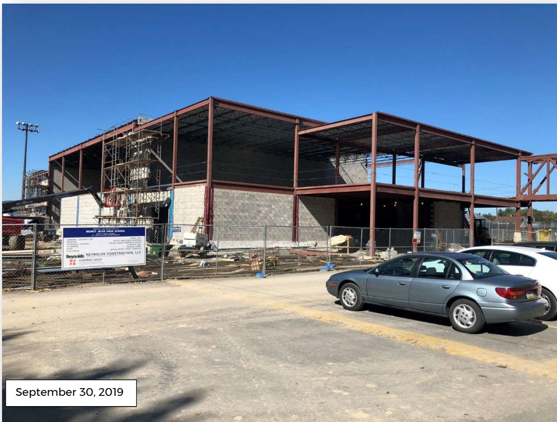
Phase 1 (New Gym Addition) Northwest View