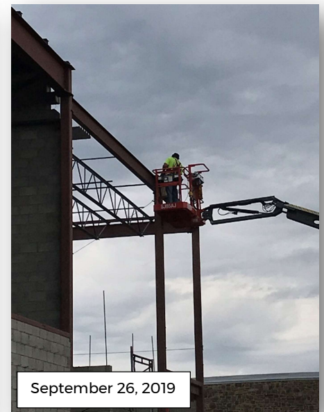
Phase 1 (New Gym Addition) Northeastern View Southwest Corner (Steel Detailing)