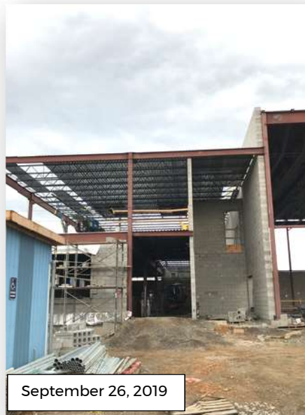
Phase 1 (New Gym Addition) Northern View Southern Elevation at Weight Room