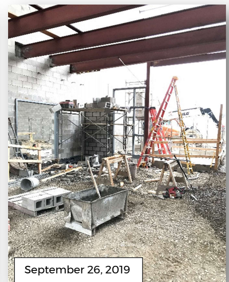
Phase 1 (New Gym Addition) Eastern View Lobby D101