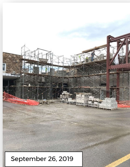
Phase 1 (New Gym Addition) Southeastern View of New Bridge Connector at Existing Building