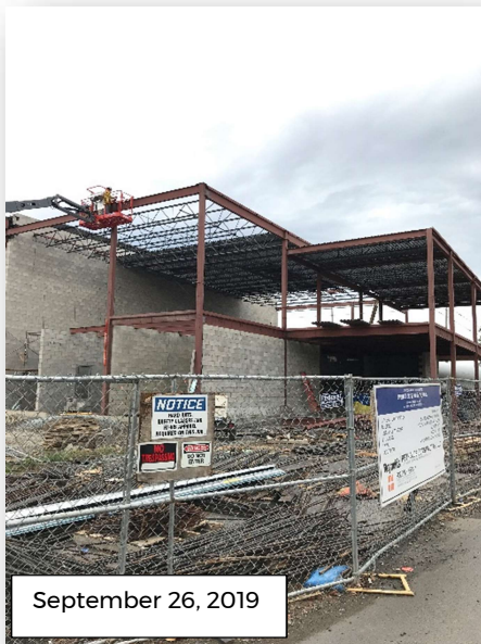
Phase 1 (New Gym Addition) Northwest View of the Southeast Corner