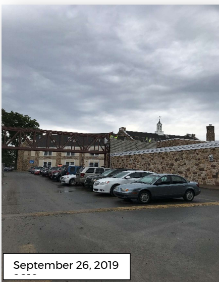
Phase 1 (New Gym Addition) Northern View of New Bridge Connector